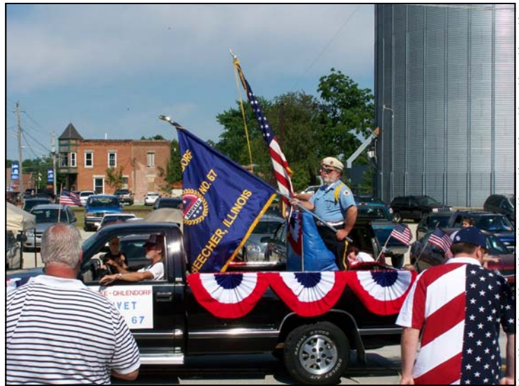
Beecher Amvets float in the 2008 Fourth of July Parade