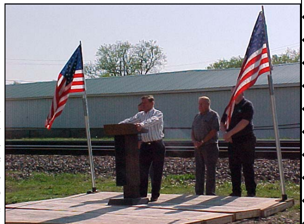
Past Arbor Day Ceremony

The program includes planting a tree (Burr Oak, American Sweetgum or Tulip Tree) approximately 2 1/2" in diameter in one of our Village parks. You will have your name engraved on a plaque in the Village Hall and will receive recognition at the annual Arbor Day festivities. The cost is only $300 and shows your commitment to the Beecher Community and also contributes to clean air and the environment. For more information contact the Village Hall.